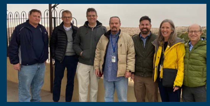
NIBS and the U.S. General Services Administration's Post Occupancy Evaluation team visited the Marcelino Serna Land Port of Entry in El Paso, kicking off the third year of federal building post occupancy evaluations.